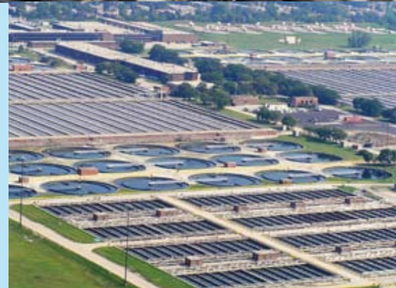
Stickney Water Reclamation Plant, Chicago Largest plant in the world