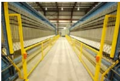
Filter presses - Green Bay, Fox River Cleanup Operable Units 2 - 5