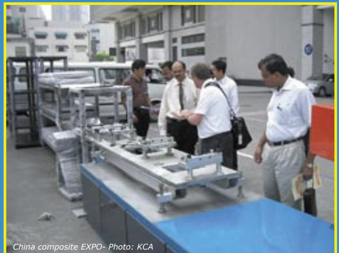
China composite EXPO- Photo: KCA