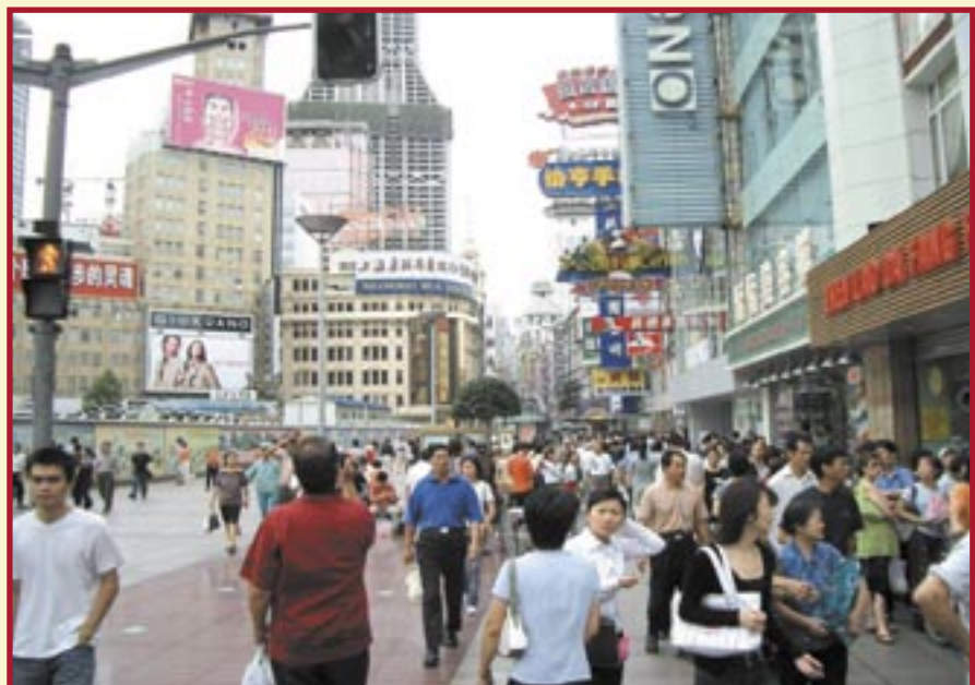
Main street Shanghai

Approved source: Lucintel USA (formely E-Composite): Publication, China Market Report 2006 "Growth Opportunities in the Chinese Composite Market 2006-2011 www.lucintel.com