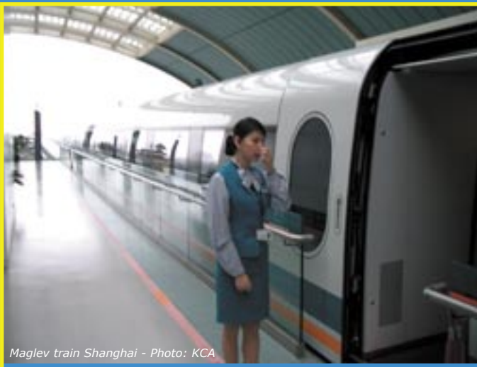
Maglev train Shanghai