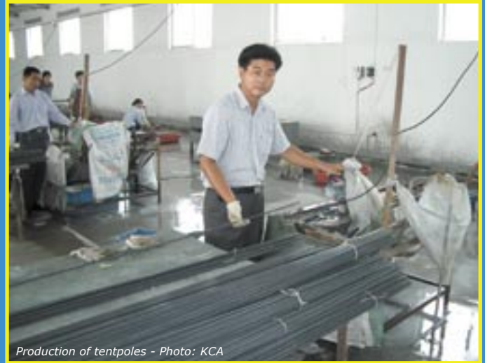
Production of tentpoles