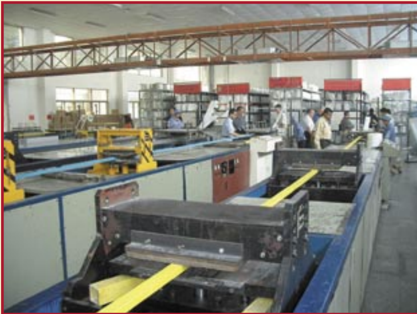
Chinese Pultrusion Factory