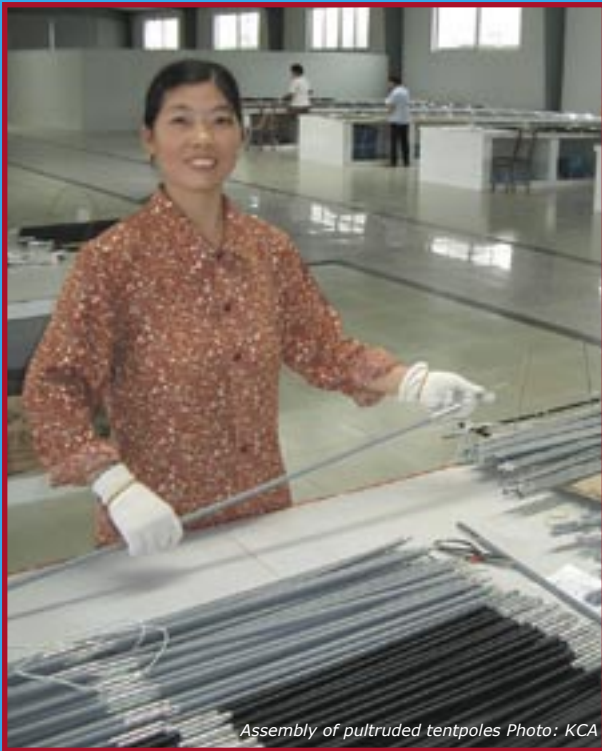
Assembly of pultruded tentpoles