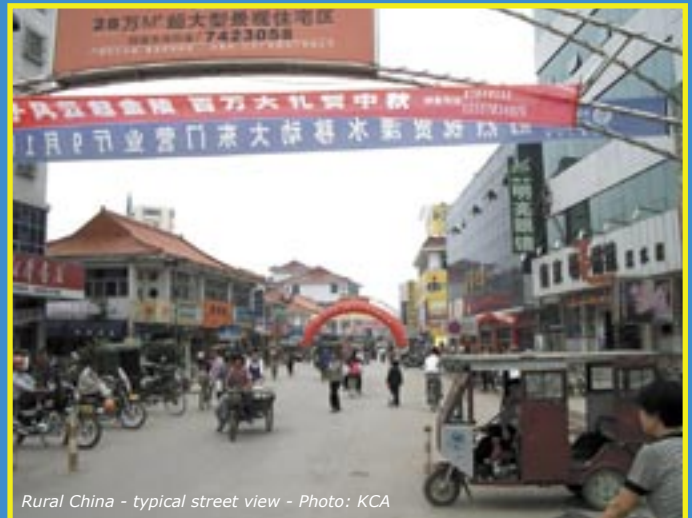
Rural China - typical street view