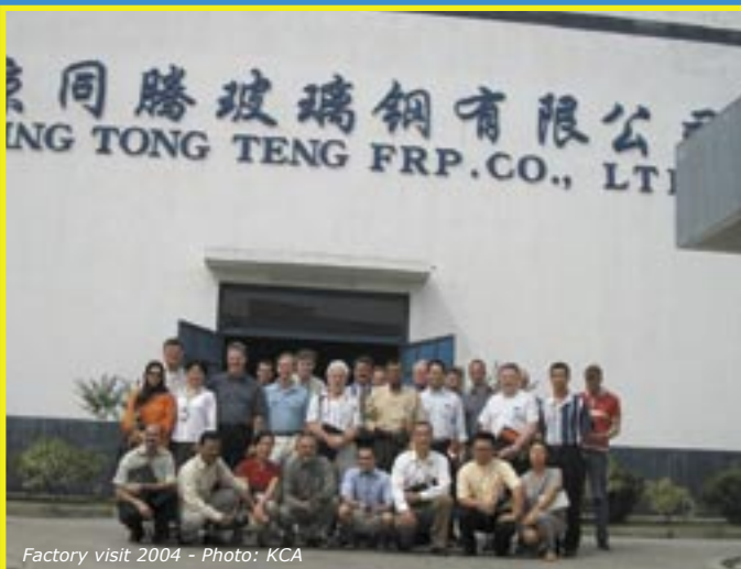
Factory visit 2004