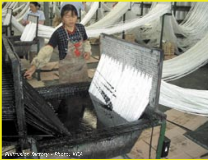
Pultrusion factory

Including visit to China Composites EXPO 2008