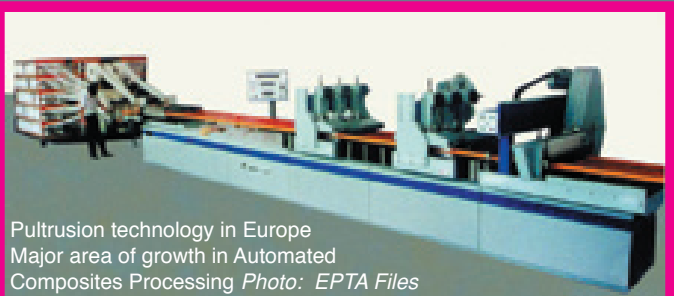
Pultrusion technology in Europe Major area of growth in Automated Composites Processing